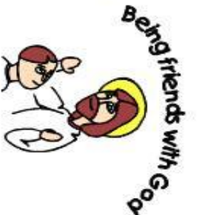
Being friends with God

6. God is my friend, this is what it means to me: